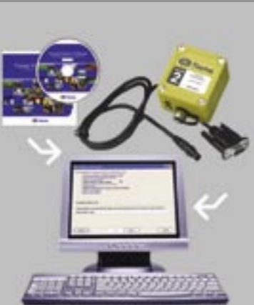
Install Tinytag Explorer software and connect data loggers to PC

There is a wide range of cost effective, waterproof, food grade and robust Probes suitable for applications as diverse as the Tinytag loggers themselves.