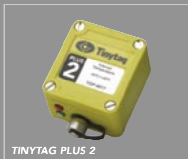
TINYTAG PLUS 2