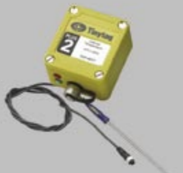
Place Data Logger in position to record and connect probe if required