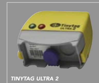
TINYTAG ULTRA 2