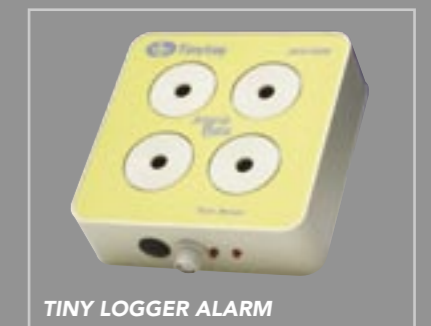
TINY LOGGER ALARM