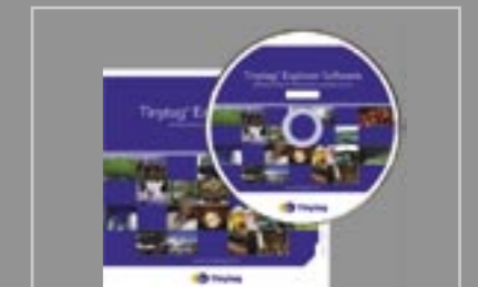
TINYTAG EXPLORER SOFTWARE

Tinytag Explorer is Windows based and user-friendly with simple steps to download and display data clearly as graphs and tables. Data can also be exported to other applications such as Excel.